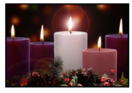
PARISH OFFICE CLOSURE: The Parish Office is closed until 9am Monday 6 January 25.

Phones and emails will be monitored throughout the holiday period.