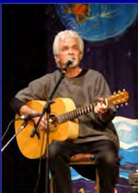
Composer of ‘Fill My House’, ‘The Beatitudes, Where is your Song, my Lord?’