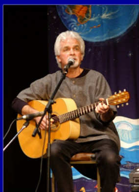
Composer of 'Fill My House', 'The Beatitudes, Where is your Song, my Lord?

Help us, Our Lady of the Visitation, to bring Christ to everyone, obeying the Father, in the love of the Spirit! Amen.