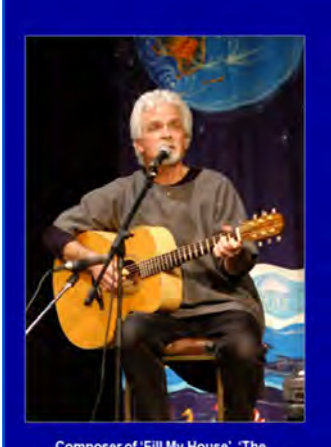
Composer of 'Fill My House, The Beatitudes, Where is your Song, my Lord?

Thank you again for your generous support of our parish and our priests.