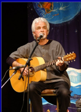
Composer of 'Fill My House', 'The Beatitudes, Where is your Song, my Lord?

As you know our friendship with St Mary's Parish Tanagai, Honiara began with our parish at World Youth Day in Sydney 2008 and these friendships have developed over the years through many visits, by both teachers, students and parishioners.