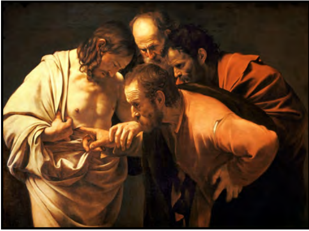
The Incredulity of St. Thomas - Caravaggio, 1603