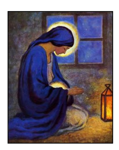
Twilight Retreat for Advent 'Waiting with Mary'

For each Sunday of Advent, we take our focus for the Advent Wreath from our Advent traditions. Like the people of the Old Testament we live in hope for the fullness of the revelation of Christ the Messiah when he will come in glory to judge the living and the dead.