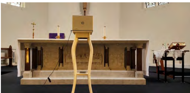
The equipment set-up: Mark I – laptop with built in mic & camera perched on a flower stand