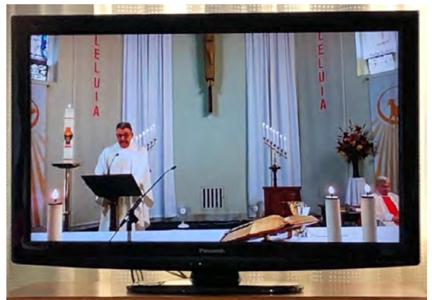
What we see from the comfort of our homes