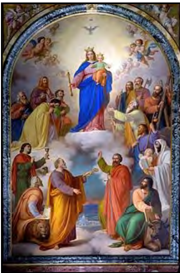
The venerated image whom Pope Leo XIII granted a Canonical coronation on 17 May 1903. The Basilica of Our Lady Help of Christians, Turin.