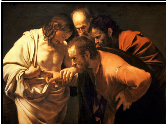
The Incredulity of St. Thomas - Caravaggio, 1603